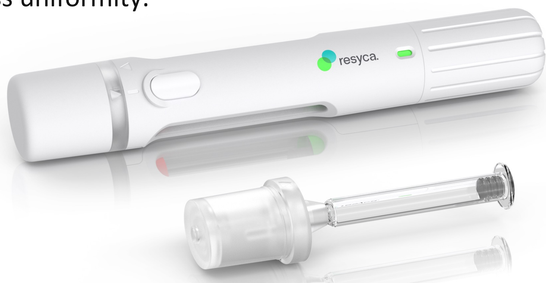
Figure 1: The Pre-filled Syringe Inhaler (PFSI™)